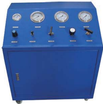
Model A closed type with carbon steel material

For the hydraulic test station(liquid booster station), we have three different cabinet design for choosing