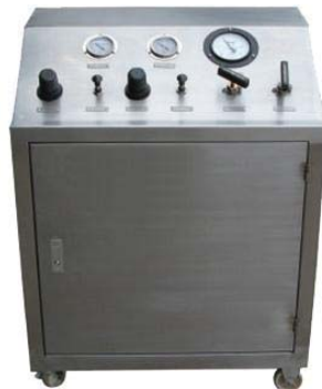
Model B closed type with stainless steel material