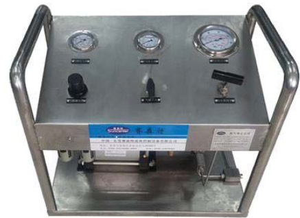
Model C frame type with stainless steel material

DLS Liquid (hydraulic) booster system = booster pump+ following valves, gages, and parts